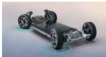
The world's only MPV with active rear-wheel steering as standard*