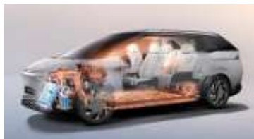
800V XPower electric drive system