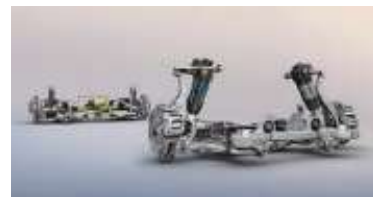
The only intelligent dual-chamber air suspension in China*