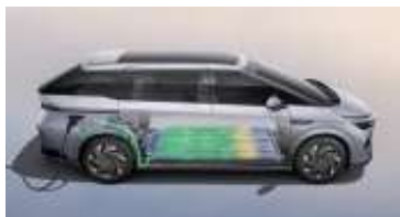
Full-range 800V high-voltage SiC silicon carbide platform

Intelligent power control, say goodbye to anxiety and welcome flexible and comfortable driving